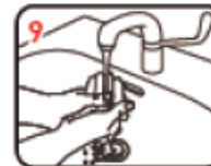
Rinse hands with water