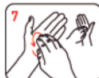
Rub tips of fingers in opposite palm in a circular motion