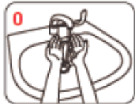
Wet hands with water