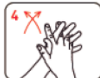
Rub palm to palm with fingers interlaced