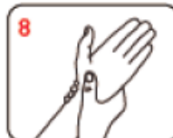
Rub each wrist with opposite hand