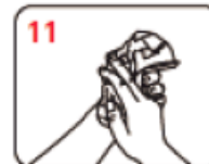
Dry thoroughly with a single-use towel