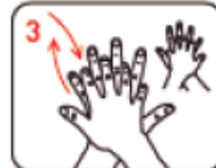
Rub back of each hand with the palm of other hand with fingers interlaced