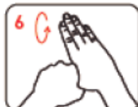
Rub each thumb clasped in opposite hand using rotational movement