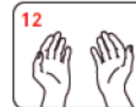
Your hands are now safe