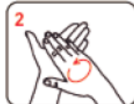
Rub hands palm to palm