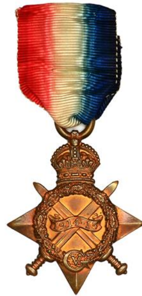
World War I medals