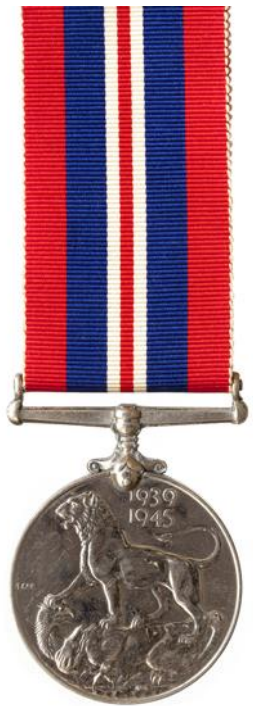
World War II medals

What symbols can you see on these medals?