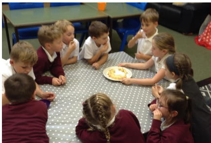
Green class trying some Spanish tortilla.