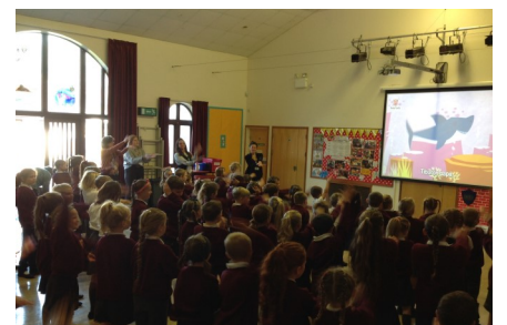
Everyone singing 'Baby Shark' in Spanish.

tasted in class and songs were sung during a whole school assembly.