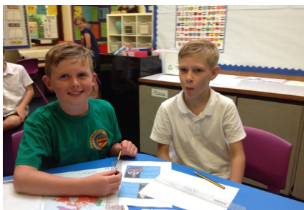
Violet class learning about Argentina.

Day of Languages. Every class was allocated a different country (not only from Europe, but from around the world) and the pupils spent the afternoon learning about their country in more depth. Spanish food was