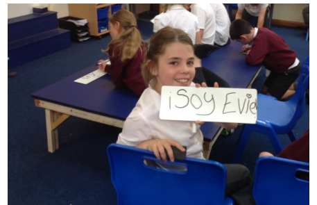
Indigo class during a Spanish lesson.

This September we celebrated the European