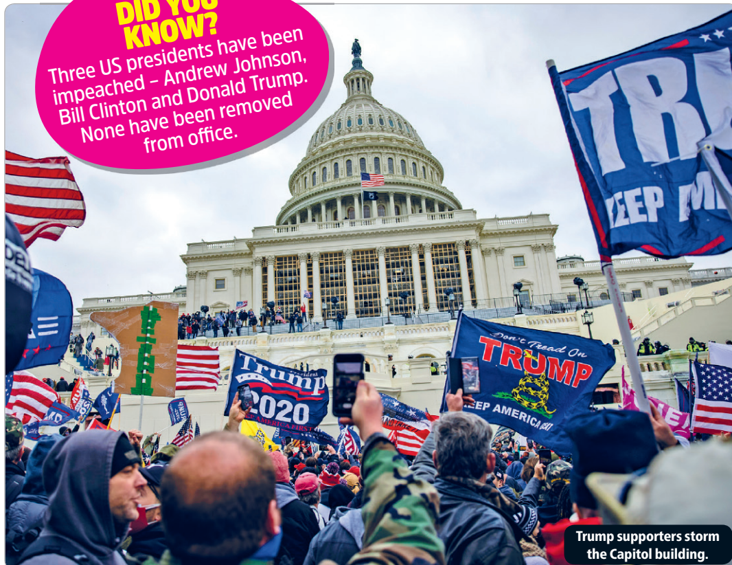
Trump supporters storm the Capitol building.

Three US presidents have been impeached – Andrew Johnson, Bill Clinton and Donald Trump. None have been removed from office.