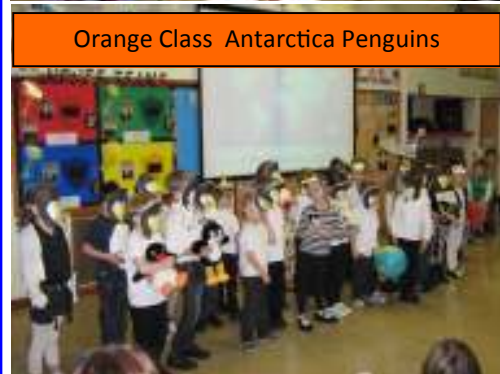
Orange Class Antarctica Penguins

As you know, we have been celebrating World Education Fortnight. This included celebration of world-wide events such as 'World Book Day', World Maths/English/Science Days' and 'World Read Aloud Day'. This all concluded on Friday 14th March with continent themed presentations from each class in assembly. We had art-work, Indian dancing, Samba music, children speaking in foreign languages, role-play, story-telling.. It was truly a delight to watch!