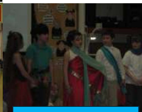
Blue Class— Indian Dancing