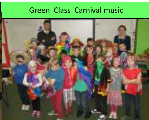
Green Class Carnival music