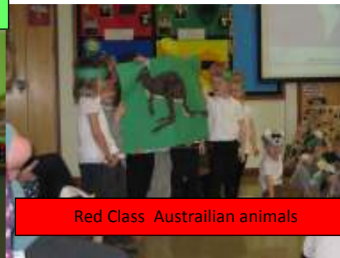
Red Class Australian animals