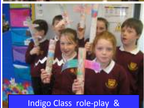
Indigo Class role-play & N. American Totem Poles