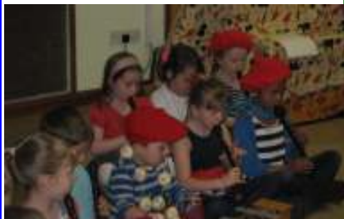
Yellow Class— French songs (recorders)